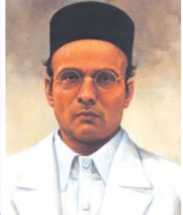
Oh Motherland, Sacrifice for you is like life! Living without you is death!!

The airport at Port Blair, Andaman and Nicobar's capital was renamed Veer Savarkar International Airport in 2002.